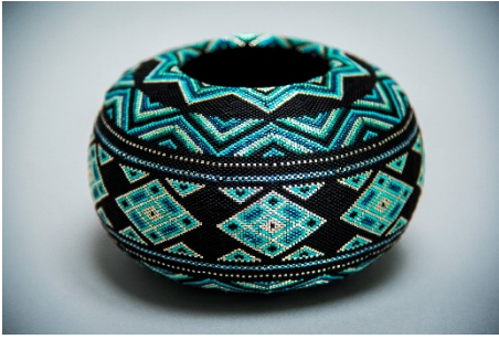
Sally Anaya, Aurora